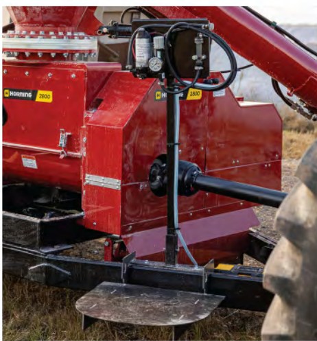
Optional Inoculant Application Kit